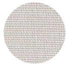
TEXTILENE -51 OFF-WHITE