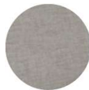
OLEFINE FABRIC -02 SAND TPU