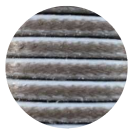
SYNTHETIC RATTAN BEIGE