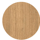
TEAK B/C NATURAL SANDED